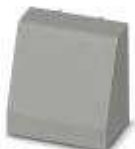
Component housing, color: gray, width: 22.5 mm

Filler plugs - EH 22,5-FP/ABS GY7035 - 2201843