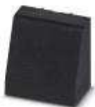
Component housing, color: black, width: 22.5 mm

Filler plugs - EH 22,5-FP/ABS BK9005 - 2201842