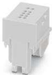
Component housing, Cover, color: light gray, width: 20.94 mm, length: 111.9 mm, height: 16.3 mm

Please be informed that the data shown in this PDF Document is generated from our Online Catalog. Please find the complete data in the user's documentation. Our General Terms of Use for Downloads are valid ( http://phoenixcontact.com/download )