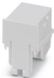
Component housing, Cover, color: light gray, width: 18.9 mm, length: 21.9 mm, height: 12.2 mm

Please be informed that the data shown in this PDF Document is generated from our Online Catalog. Please find the complete data in the user's documentation. Our General Terms of Use for Downloads are valid ( http://phoenixcontact.com/download )