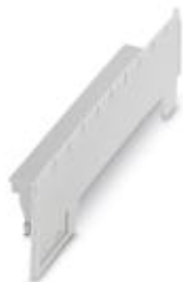
Component housing, Cover, color: light gray, width: 20.94 mm, length: 111.9 mm, height: 16.3 mm

Please be informed that the data shown in this PDF Document is generated from our Online Catalog. Please find the complete data in the user's documentation. Our General Terms of Use for Downloads are valid ( http://phoenixcontact.com/download )