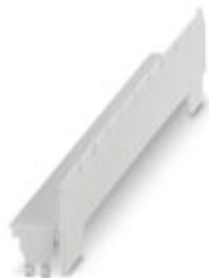
Component housing, Cover, color: light gray, width: 20.94 mm, length: 111.9 mm, height: 16.3 mm

Please be informed that the data shown in this PDF Document is generated from our Online Catalog. Please find the complete data in the user's documentation. Our General Terms of Use for Downloads are valid ( http://phoenixcontact.com/download )