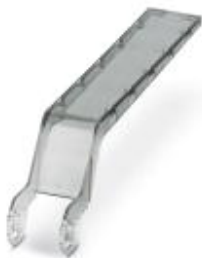
Component housing, Marking cover, color: transparent, width: 20.94 mm, length: 111.9 mm, height: 16.3 mm

Please be informed that the data shown in this PDF Document is generated from our Online Catalog. Please find the complete data in the user's documentation. Our General Terms of Use for Downloads are valid ( http://phoenixcontact.com/download )