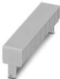
Component housing, Cover, color: light gray, width: 18.9 mm, length: 87.8 mm, height: 12.2 mm

Please be informed that the data shown in this PDF Document is generated from our Online Catalog. Please find the complete data in the user's documentation. Our General Terms of Use for Downloads are valid ( http://phoenixcontact.com/download )