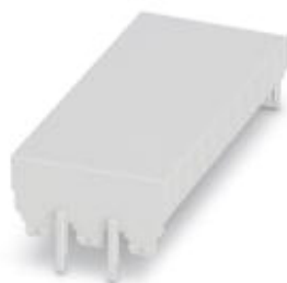
Component housing, Cover, color: light gray, width: 56.88 mm, length: 109.8 mm, height: 12.2 mm

Please be informed that the data shown in this PDF Document is generated from our Online Catalog. Please find the complete data in the user's documentation. Our General Terms of Use for Downloads are valid ( http://phoenixcontact.com/download )