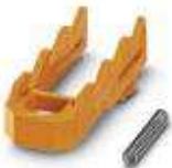
Component housing, Lock and Release system, color: orange, width: 16.2 mm, length: 33 mm

Electronic housing - HSC-LR 3U KIT 2003 - 2201797