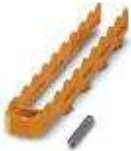
Component housing, Lock and Release system, color: orange, width: 16.2 mm, length: 99 mm

Electronic housing - HSC-LR 9U KIT 2003 - 2201794