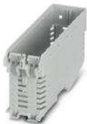
Component housing, Lower part, color: light gray, width: 37.6 mm, length: 120.6 mm, height: 57.7 mm

Please be informed that the data shown in this PDF Document is generated from our Online Catalog. Please find the complete data in the user's documentation. Our General Terms of Use for Downloads are valid ( http://phoenixcontact.com/download )