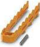
Component housing, Lock and Release system, color: orange, width: 16.2 mm, length: 77 mm

Electronic housing - HSC-LR 7U KIT 2003 - 2201795