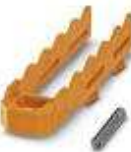
Component housing, Lock and Release system, color: orange, width: 16.2 mm, length: 55 mm

Electronic housing - HSC-LR 5U KIT 2003 - 2201796