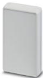
Handheld housing, C-Mini-Plus, light gray, consisting of two half shells, two front plates with screws, front 1.1 mm recessed, closed

Please be informed that the data shown in this PDF Document is generated from our Online Catalog. Please find the complete data in the user's documentation. Our General Terms of Use for Downloads are valid ( http://phoenixcontact.com/download )