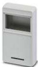
Handheld housing, C-Mini-Plus, light gray, consisting of two half shells, screws. Front 1.1 mm recessed, with window and keypad slot, battery compartment cover and battery contacts for 2 AA batteries

Please be informed that the data shown in this PDF Document is generated from our Online Catalog. Please find the complete data in the user's documentation. Our General Terms of Use for Downloads are valid ( http://phoenixcontact.com/download )