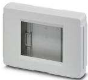
Display housing, 5.6"/5.7", light gray, central window, front level, consisting of two half shells, four front plates with screws

Please be informed that the data shown in this PDF Document is generated from our Online Catalog. Please find the complete data in the user's documentation. Our General Terms of Use for Downloads are valid ( http://phoenixcontact.com/download )