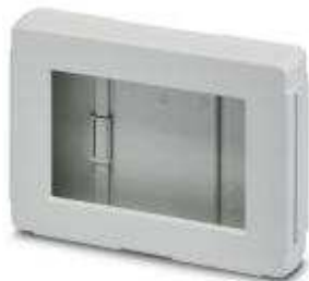
Display housing, 7", light gray, central window, front level, consisting of two half shells, four front plates with screws

Please be informed that the data shown in this PDF Document is generated from our Online Catalog. Please find the complete data in the user's documentation. Our General Terms of Use for Downloads are valid ( http://phoenixcontact.com/download )