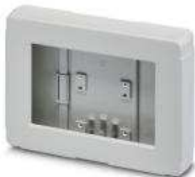
Display housing, 7", light gray, central window, front level, for battery pack consisting of two half shells, with screws and battery pack contacts

Please be informed that the data shown in this PDF Document is generated from our Online Catalog. Please find the complete data in the user's documentation. Our General Terms of Use for Downloads are valid ( http://phoenixcontact.com/download )