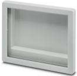
Display housing, 15", light gray, central window, front level, consisting of two half shells with screws

Please be informed that the data shown in this PDF Document is generated from our Online Catalog. Please find the complete data in the user's documentation. Our General Terms of Use for Downloads are valid ( http://phoenixcontact.com/download )