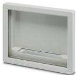
Display housing, 15", light gray, central window, front level, with cutout for connection technology angle plate consisting of two half shells with screws

Please be informed that the data shown in this PDF Document is generated from our Online Catalog. Please find the complete data in the user's documentation. Our General Terms of Use for Downloads are valid ( http://phoenixcontact.com/download )