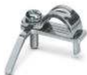
Shield connection clip for printed circuit terminal block

Components of electronic housing - ME-SAS MINI - 2200456