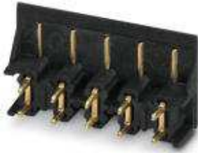
Contact strip for DIN rail connector

Please be informed that the data shown in this PDF Document is generated from our Online Catalog. Please find the complete data in the user's documentation. Our General Terms of Use for Downloads are valid ( http://phoenixcontact.com/download )