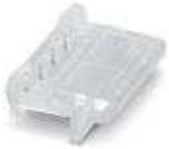
Ejector for COMBICON plug

Components of electronic housing - ME PS-17,5 MC TRANS - 2279842