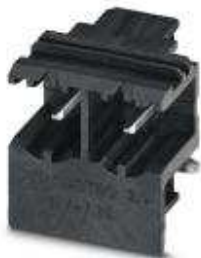
Header, nominal current: 16 A, rated voltage (III/2): 630 V, mounting: Taped SMD/THT/THR components

Please be informed that the data shown in this PDF Document is generated from our Online Catalog. Please find the complete data in the user's documentation. Our General Terms of Use for Downloads are valid ( http://phoenixcontact.com/download )