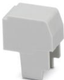
Filler plug for unoccupied terminal points, color: Light gray

Please be informed that the data shown in this PDF Document is generated from our Online Catalog. Please find the complete data in the user's documentation. Our General Terms of Use for Downloads are valid ( http://phoenixcontact.com/download )