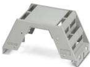
Component housing, Upper part, color: light gray, width: 45 mm, length: 99 mm, height: 38.5 mm

Please be informed that the data shown in this PDF Document is generated from our Online Catalog. Please find the complete data in the user's documentation. Our General Terms of Use for Downloads are valid ( http://phoenixcontact.com/download )