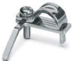
Shield connection clip for printed circuit terminal block

Please be informed that the data shown in this PDF Document is generated from our Online Catalog. Please find the complete data in the user's documentation. Our General Terms of Use for Downloads are valid ( http://phoenixcontact.com/download )