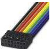
Power connector for DIN rail bus connector with 16 free cable ends with a cross section of 0.25 mm 2 , 500 mm long, female contacts