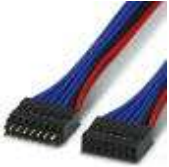
Cable bridge for cross-DIN-rail connection of the HBUS connector

Electronic housing - BSL-2,54/16-ST 40CM - 2202938