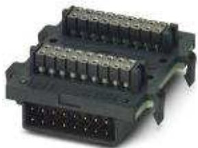
Plug component, nominal current: 3 A, number of positions: 16, pitch: 2.54 mm, color: jet black

Please be informed that the data shown in this PDF Document is generated from our Online Catalog. Please find the complete data in the user's documentation. Our General Terms of Use for Downloads are valid ( http://phoenixcontact.com/download )