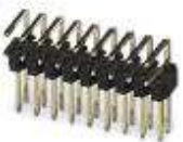
Pin strip (horizontal)

Pin strip - PSTD 0,65X0,65/9-H-2,54 - 2200701