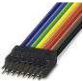
Power connector for DIN rail bus connector with 16 free cable ends with a cross section of 0.25 mm 2 , 500 mm long, male contacts