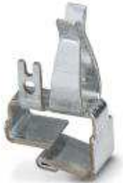
Functional earth ground contact, for intermediate elements.

Please be informed that the data shown in this PDF Document is generated from our Online Catalog. Please find the complete data in the user's documentation. Our General Terms of Use for Downloads are valid ( http://phoenixcontact.com/download )