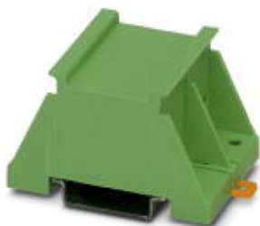
Mounting plate for screwing on switchgear, high-profile version

Please be informed that the data shown in this PDF Document is generated from our Online Catalog. Please find the complete data in the user's documentation. Our General Terms of Use for Downloads are valid ( http://phoenixcontact.com/download )