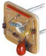
function indicator (glow lamp)