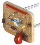
function indicator (glow lamp) (2 LED's)