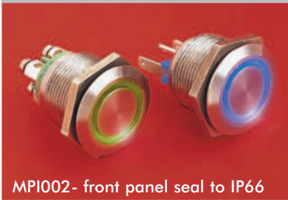
MPI002- front panel seal to IP66