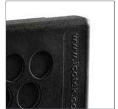
Also available in black.