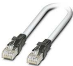
Patch cable, CAT5, assembled, 2 m

https://www.phoenixcontact.com/gb/products/2832289