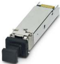
The small form-factor plug-in module provides a fiber optic interface with a data transmission speed of 100 Mbps with a wavelength of 1310 nm (long).

https://www.phoenixcontact.com/gb/products/2891081