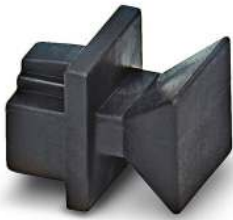
Dust protection caps for RJ45 socket

https://www.phoenixcontact.com/gb/products/2832991