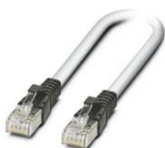
Patch cable, CAT5, assembled, 2 m

https://www.phoenixcontact.com/gb/products/2832289