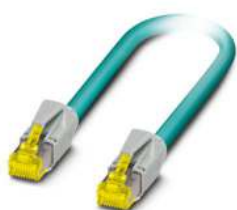
Patch cable, degree of protection: IP20, number of positions: 8, 10 Gbps, CAT6 A , cable outlet: straight, Ethernet

https://www.phoenixcontact.com/gb/products/1411854