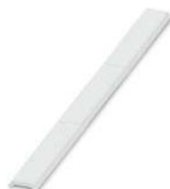
Zack Marker strip, flat, Strip, white, unlabeled, can be labeled with: PLOTMARK, CMS-P1-PLOTTER, mounting type: snapped, for terminal block width: 29 mm, lettering field size: 29 x 6.4 mm, Number of individual labels: 30

https://www.phoenixcontact.com/gb/products/0829003