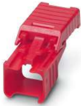
Lockable security element

https://www.phoenixcontact.com/gb/products/2891424